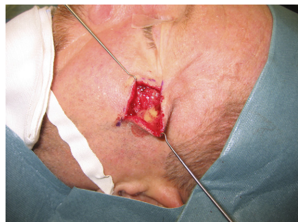
Figure 3 A localised festering mass with no macroscopic remnants of polyalkylimide was surgically removed from this indurated area.

among the course of complications in these and our first patient (Table 2). HIV-positive patients typically present late in their fifth, or early in their sixth decade, whereas cosmetic patients presented with facial wrinkles in their fourth decade. 9 Additional invasive therapy at, or near, the site of injections had triggered the onset of infection in seven of the additional seventeen patients seen with this complication. These therapies included additional injection of filler material ( n=2 ),